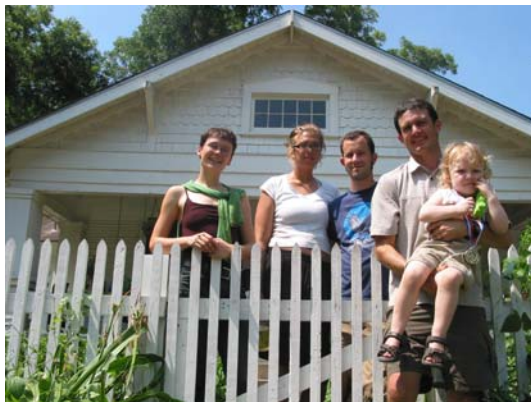
The backyard crew this week!

Since we now have a firm date for the farm purchase, we have decided that Saturday July 29 will be our last weekend delivering vegetable boxes until we start production at the new farm. We are hoping to be able to start deliveries back in January 2007 and possibly sooner....we will let you know.